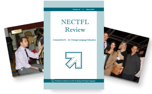
Go to Northeast Conference on the Teaching of Foreign Languages