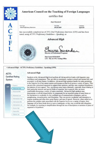
Your course placement is...