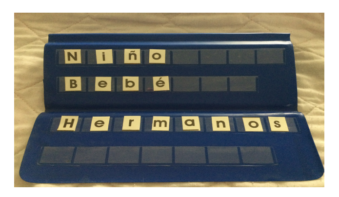
Using the vocabulary words in sentences through dictation