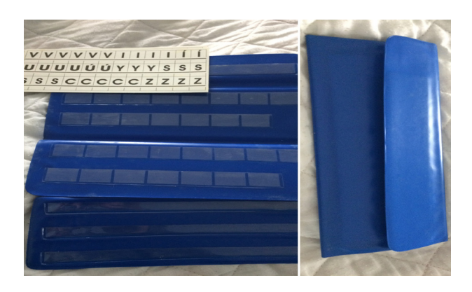
Vocabulary spelling and practice.